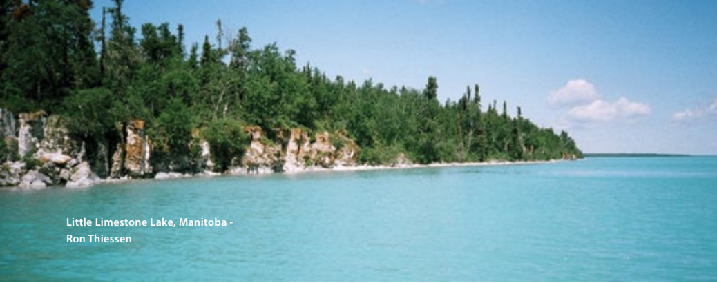
Little Limestone Lake, Manitoba - Ron Thiessen