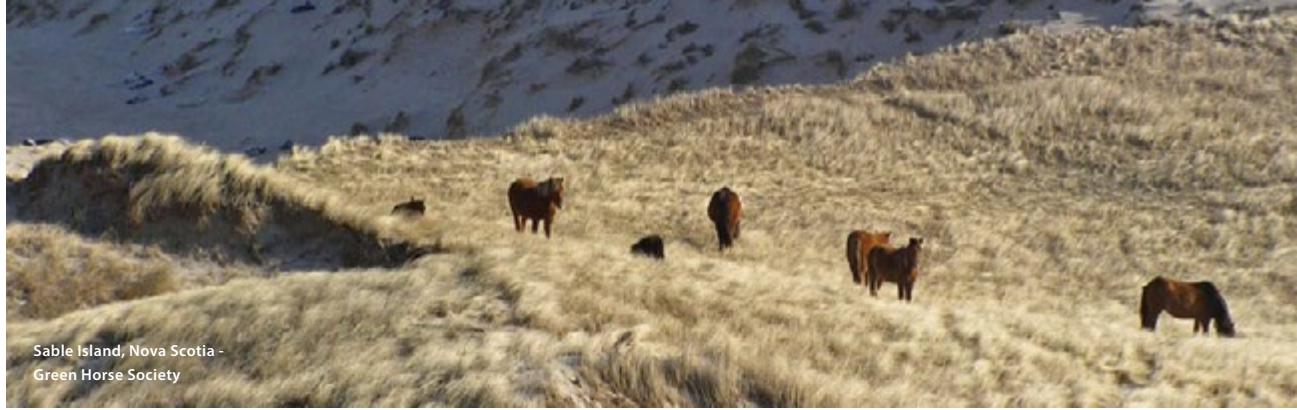
Sable Island, Nova Scotia - Green Horse Society