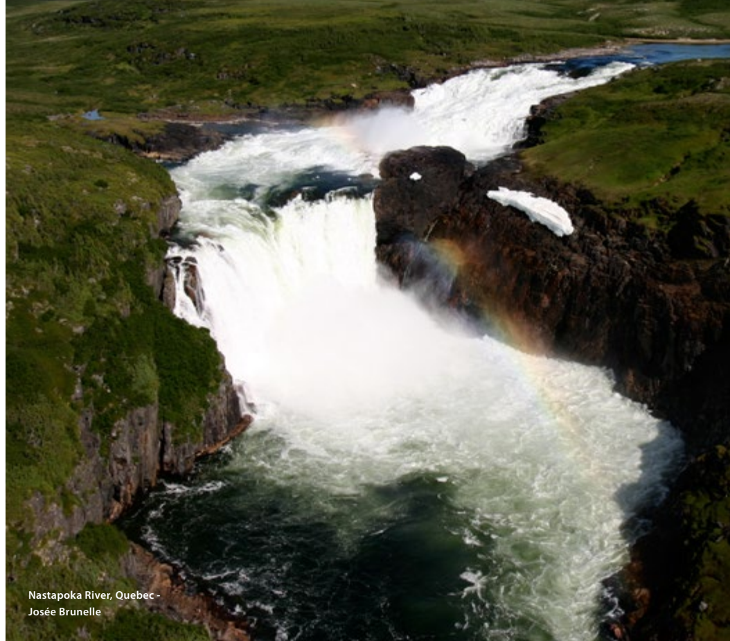
Nastapoka River, Quebec - Josée Brunelle