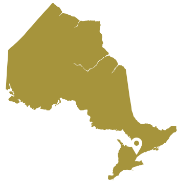
PROPOSED ROUGE NATIONAL URBAN PARK, ONTARIO

To ensure adequate ecological connectivity from Lake Ontario to the Oak Ridges Moraine, CPAWS is recommending that important ecological lands adjacent to the current Rouge National Urban Park study area also be permanently protected from urban development.