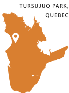
TURSUJUQ PARK, QUEBEC