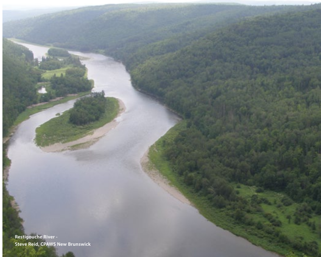
Restigouche River - Steve Reid, CPAWS New Brunswick