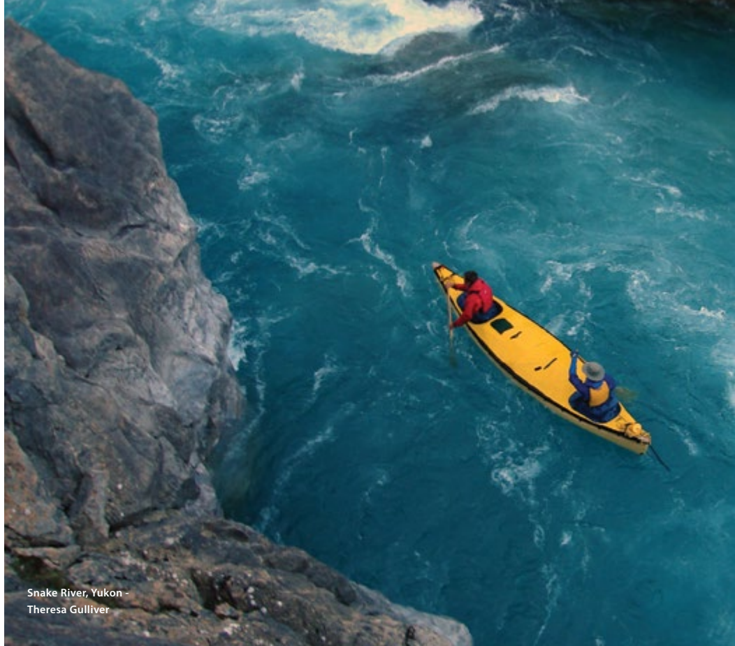
Snake River, Yukon - Theresa Gulliver