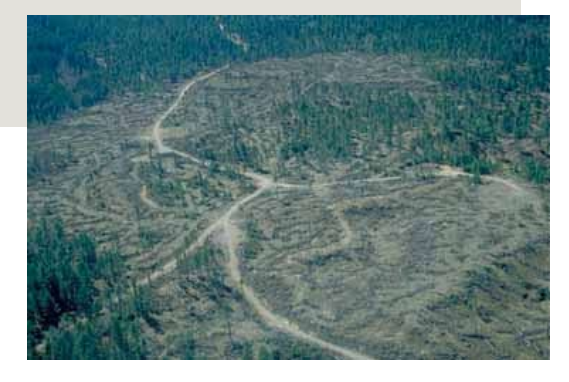
AERIAL SHOT OF LOGGING IN ALGONQUIN

A 2006 Ontario government report recommended increasing protection from logging within the park to more than half of the park. Nearly 80% of the public opposes logging in parks. However, new regulations to reduce the amount of logging within the park's borders have not been forthcoming. With the G8 leaders arriving in 2010 in Huntsville, a town bordering the park, a move to reduce logging and improve its future ecological integrity would be timely.